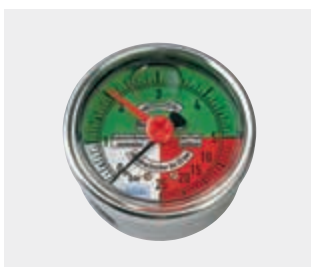
63-mm dial, rear connector