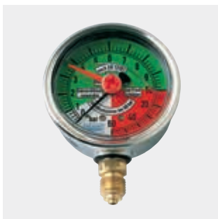
63-mm dial, bottom connector