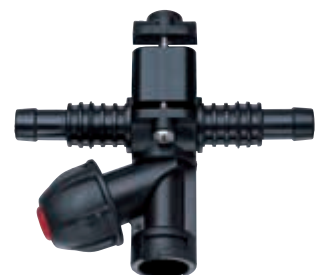
Two-hose connector for 3/4" boom tubings (25-28 mm O.D.) 065.275.56.KL for 1/2" boom tubings (20-22 mm O.D.) 065.275.56. KH