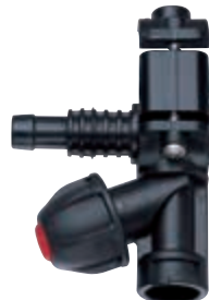
Single-hose connector for 3/4" boom tubings (25-28 mm O.D.) 065.274.56.KL for 1/2" boom tubings (20-22 mm O.D.) 065.274.56.KH