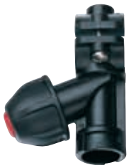
Diaphragm check valve with eyelet connector for 3/4" pipes 065.272.56.KL for 1/2" pipes 065.272.56.KH