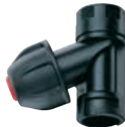
Diaphragm check valve for threaded connection M 18 x 1.5 065.272.56.HB