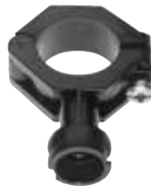
Bayonet adapter with female thread M 18 x 1.5 Ordering no. 095.009.00.07.98