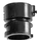
Ball check valve 60 M 065.265.56.00 25 M 065.266.56.00