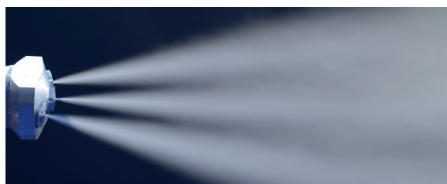
Spray pattern of a 1AW nozzle